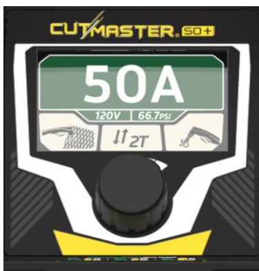
Simple and intuitive TFT LCD panel

Cutmaster 50+ is the perfect combination of power and portability for hand-held plasma cutting machines. Plus means more, so we've added a user-friendly 10.9 cm (4.3 in.) TFT LCD screen and upgraded features that give you even more control and flexibility to master any cut up to 25 mm (1 in.). Together with the SL60 1Torch, it all adds up to the total plasma cutting package.