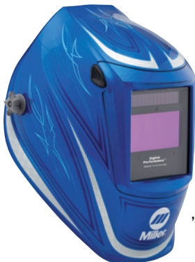
'64 Custom™ 296751