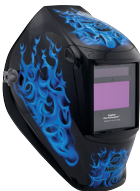
Blue Rage™ 296753