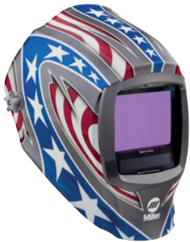
Stars and Stripes™ 296780