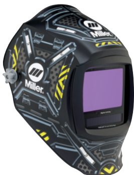
Black Ops™ 296779