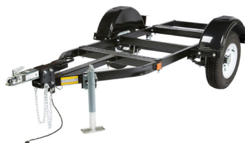
K2636-1 Medium Welder Trailer (shown with K2639-1 Fender & Light Kit)