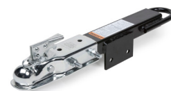
Duo-Hitch® 2 in. (51 mm) Ball/ Lunette Eye Hitch (included)