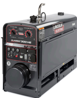
Classic® 300 HE