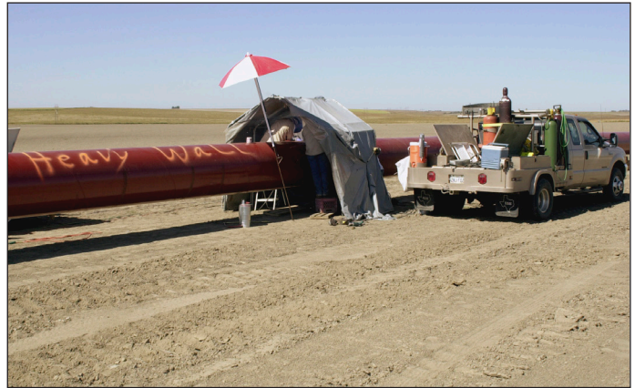
Cross-country pipe welding.