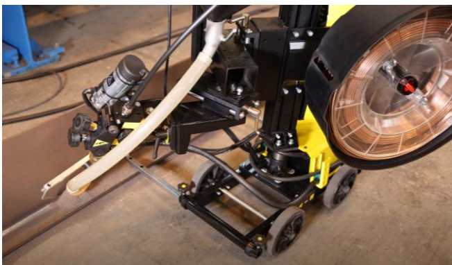
Versotrac Cadet is the ideal tractor for fillet welds.

For more than 70 years, ESAB has designed welding tractors to make submerged arc welding easier and faster. The Versotrac Cadet is the newest addition to the family designed for SAW automation.