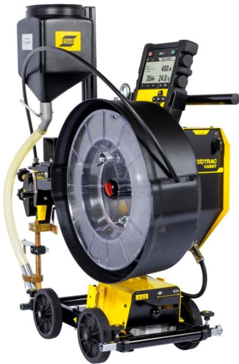
Versotrac Cadet single wire