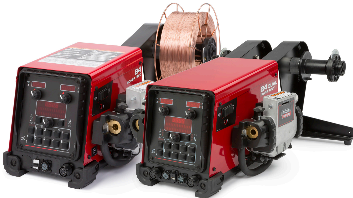
Shown: Power Feed 84 - Single (K3328-7) Power Feed 84 - Dual (K3330-7)