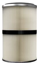
KP5178-1 FILTER, MERV 11, POLYESTER