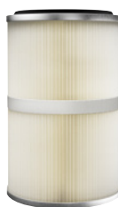
KP5178-2 FILTER, MERV 16, Cellulose/Nano