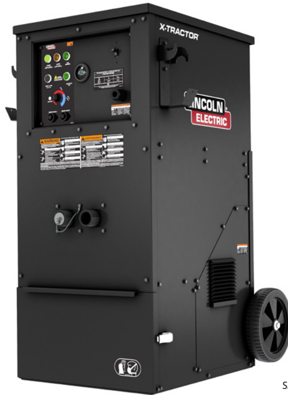
Shown: X-Tractor 2 Fume Gun K5271-1